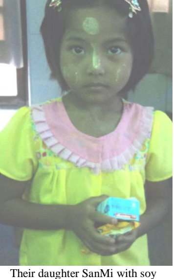
milk and cookie pack.