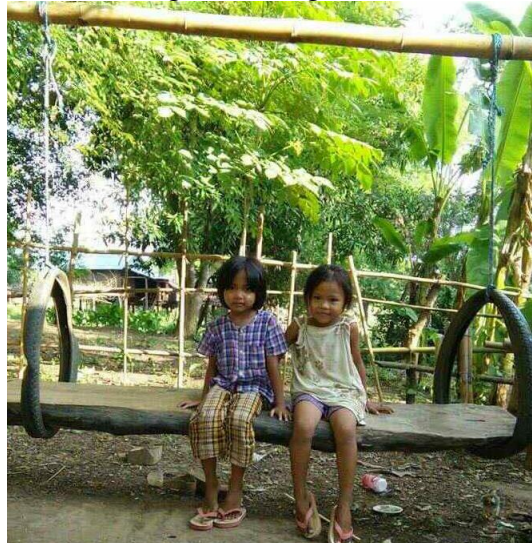
On her Dad's homemade swing with the neighbor girl.