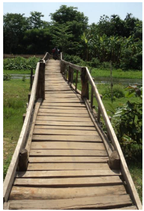
Repaired bridge—for motorcycles too, or anything that fits can get across.

Services were held at the Pun Swe Taw hotel in downtown Taungoo, where we stayed for four days. I did not go on the trek to Kyawk (Jawk) Taing village because of the heat at this time of year. In order to reach the small village of Jawk Taing, one must travel by paved road for about half an hour, cross a wooden bridge (which Gloria says has been repaired and is now easy to cross for the time being), then trek up a narrow jungle path for about 20 minutes before reaching the Church of God compound.