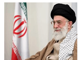
Ayatollah Ali Khamenei

Supreme leader Ayatollah Ali Khamenei, who this week congratulated Ahmadinejad for his role in Iran's nuclear case, said that Islamic countries do not need US approval to achieve great works."..."