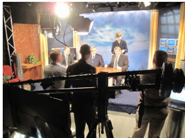
Beyond Today recording on March 7

The recording session began with a prayer asking God that all the preparatory work with the script come together properly in the production of television program. The program was part of a series on "Living in Modern Babylon" and spoke of how we must uphold principles while living in a society that may oppose them.