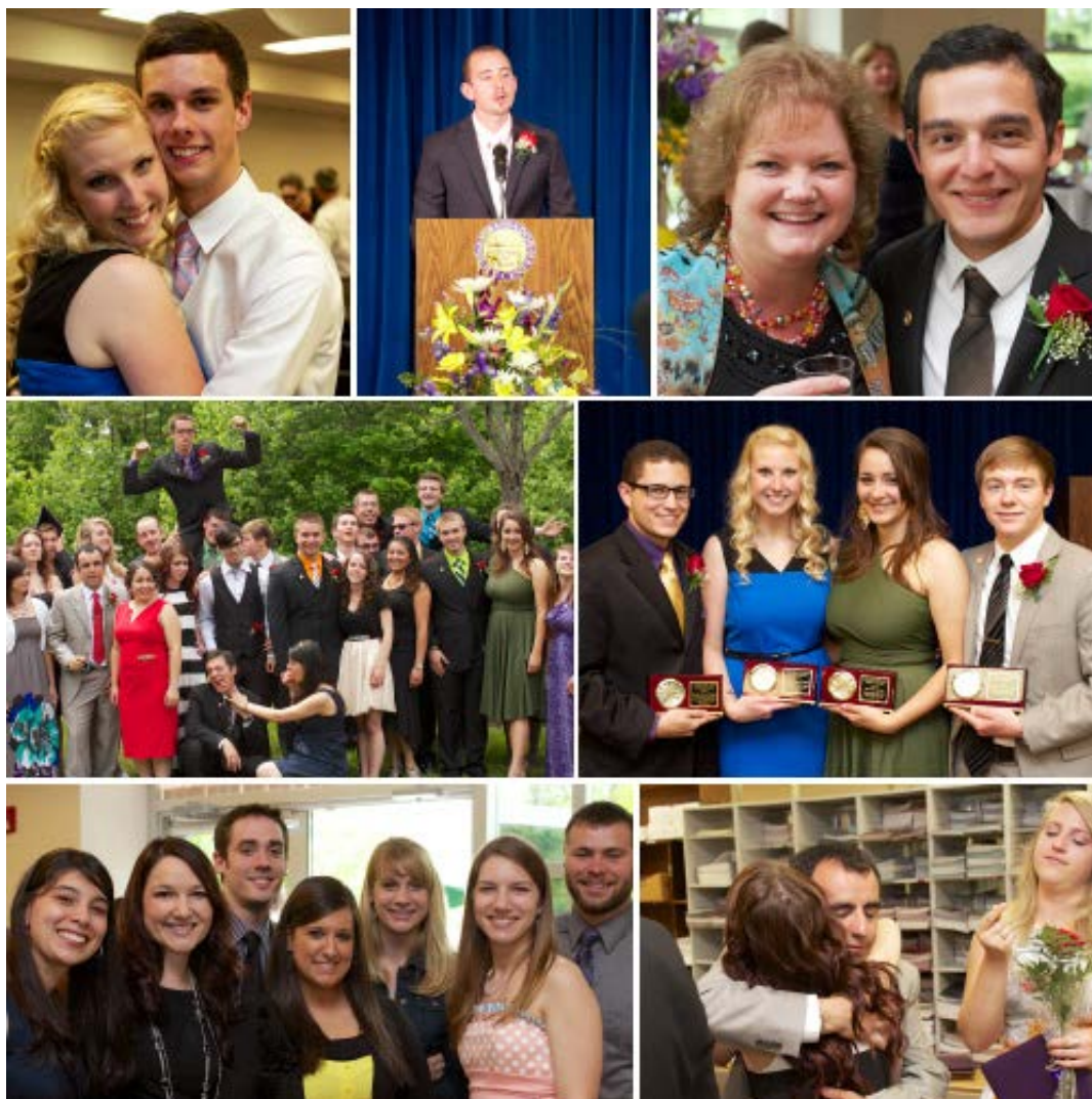
Graduation Day May 26, 2013

As the ABC students go back into your church areas, please receive them with a special welcome. Please be open to their desire to serve in your area and indeed make them a part of your congregation family. I was so impressed by the energy of this class that wished to be involved. Please give them opportunities as they are appropriate.